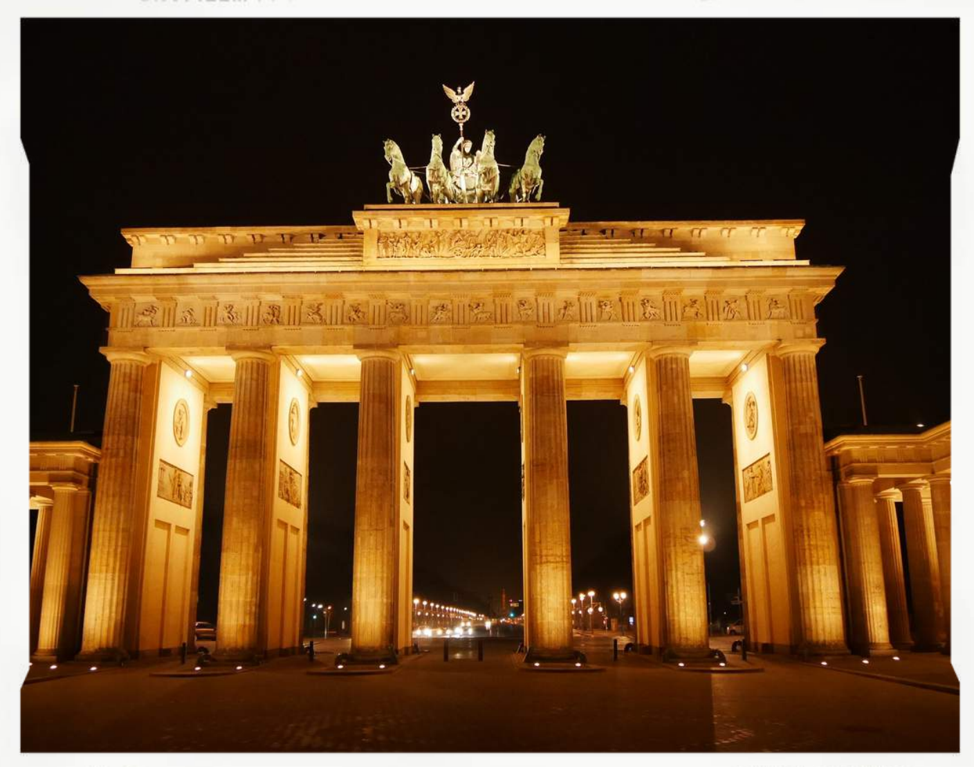
23 CANVA STORIES